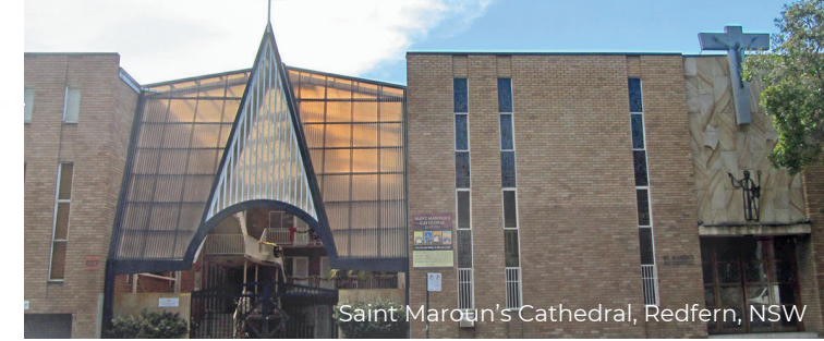
Saint Maroun's Cathedral, Redfern, NSW